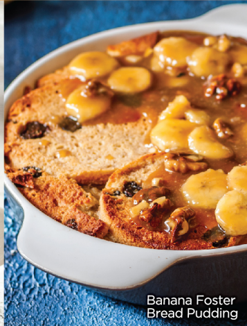
Banana Foster Bread Pudding