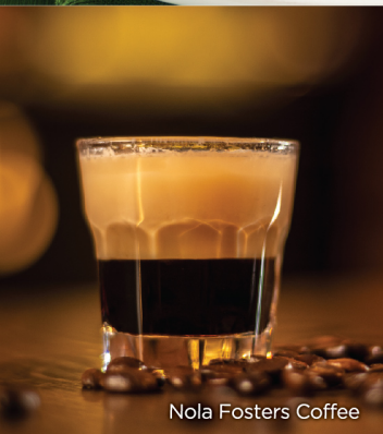
Nola Fosters Coffee