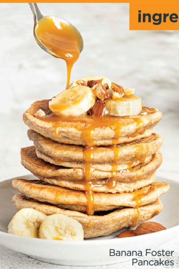
Banana Foster Pancakes