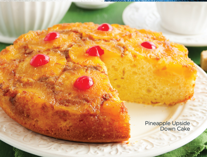
Pineapple Upside Down Cake

Ice Cream Topping - add to ice cream, used both hot and cold