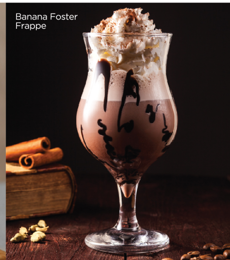
Banana Foster Frappe