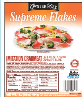
1 lb package

All White Imitation Crab Item No. 690074 GTIN: 50049029063660