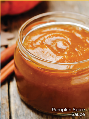
Pumpkin Spice Sauce