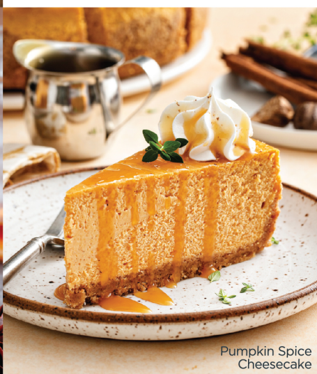
Pumpkin Spice Cheesecake