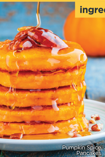
Pumpkin Spice Pancakes