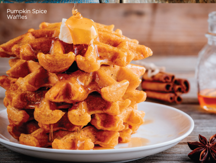
Pumpkin Spice Waffles

Ice Cream Topping - add to ice cream, used both hot and cold