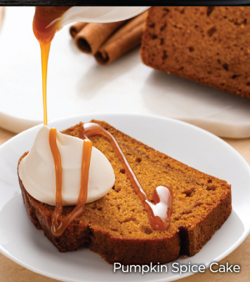
Pumpkin Spice Cake