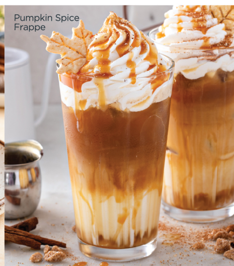
Pumpkin Spice Frappe